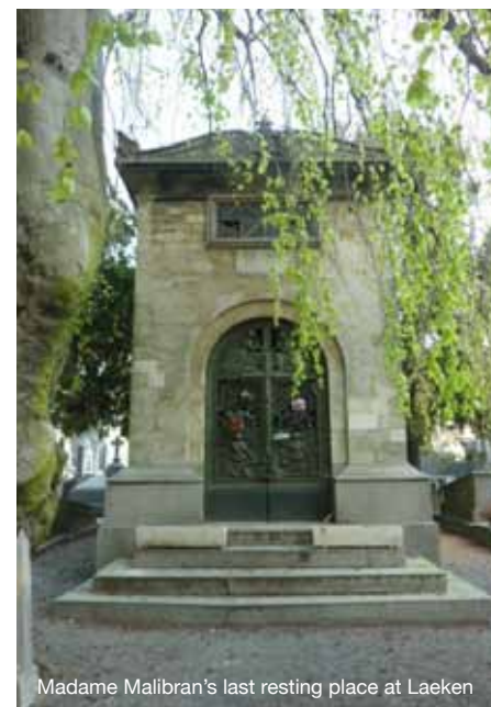
Madame Malibran's last resting place at Laeken

But she was in fragile health, due, it is said, to the after-effects of a spectacular fall from her horse some months previously. And it seems she